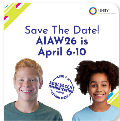
Social media post